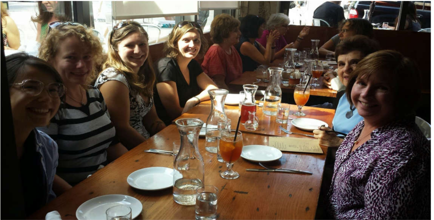
Downtown Meet & Greet