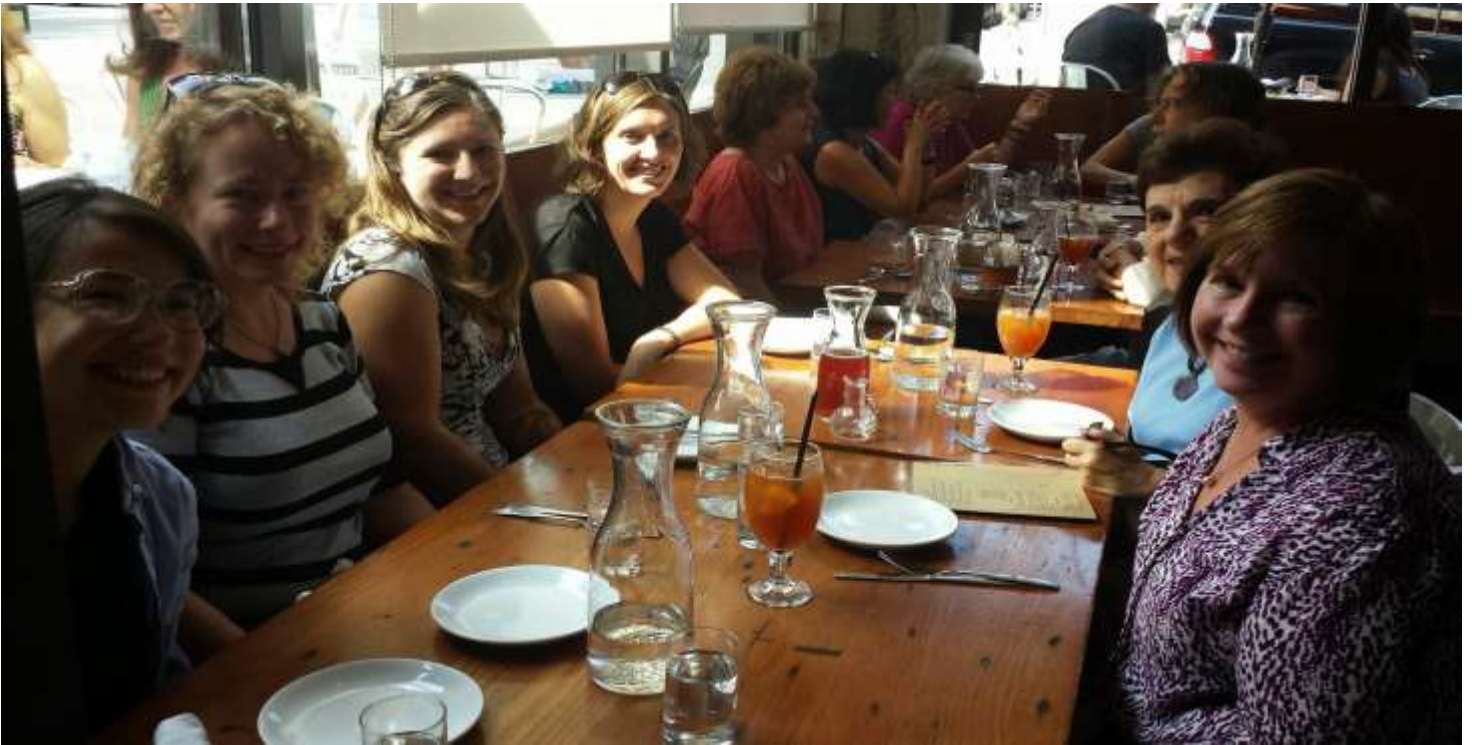
Downtown Meet & Greet